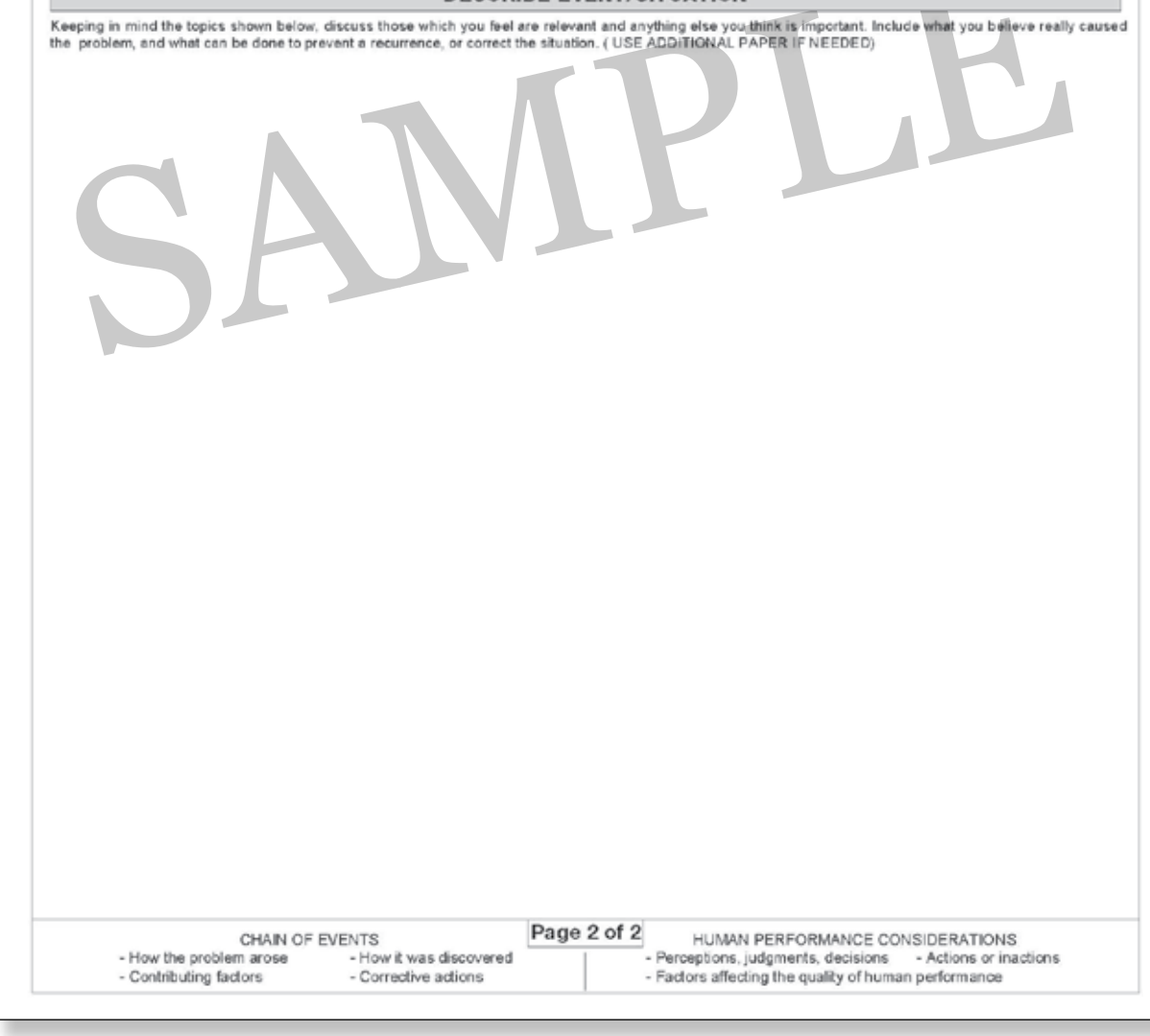
Figure 1-5. ASRS Incident Report (page 2 of 2).